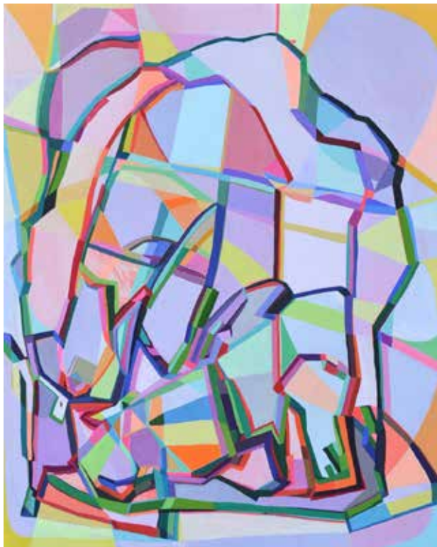
Flashlight , 2016 Gouache on panel 20 x 16 inches $1,400