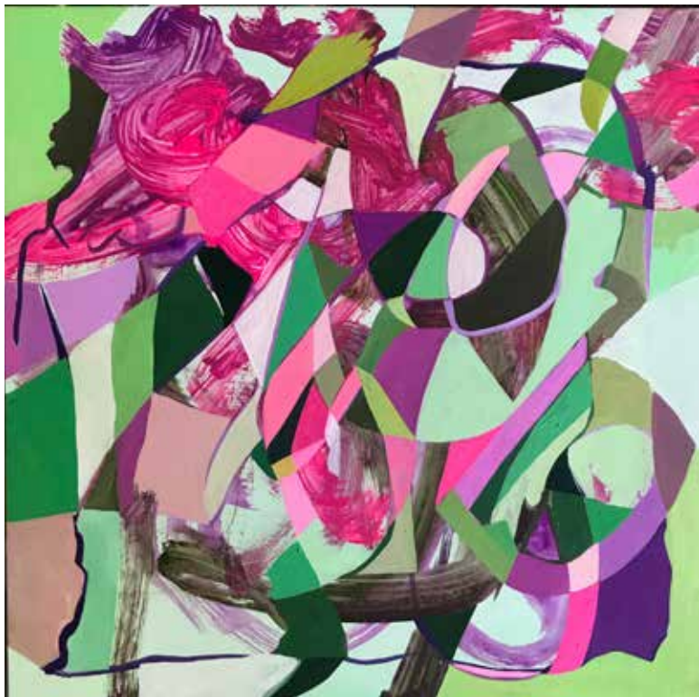
Grouping Pairs, 2016 Gouache on panel 10 x 10 inches $975