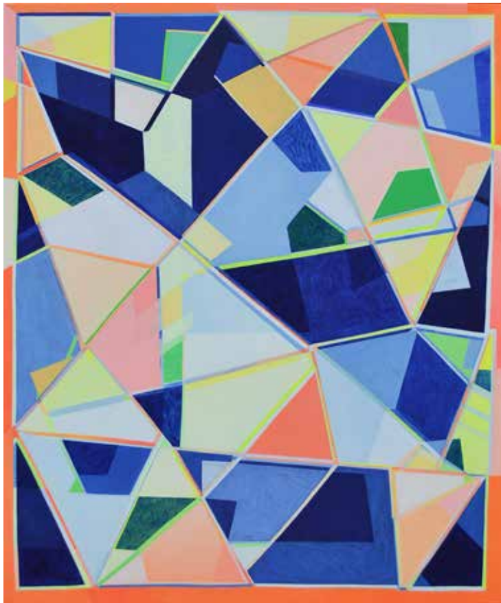
Waking Up in a Tiny House , 2018 Acrylic on canvas 72 x 60 inches $6,200