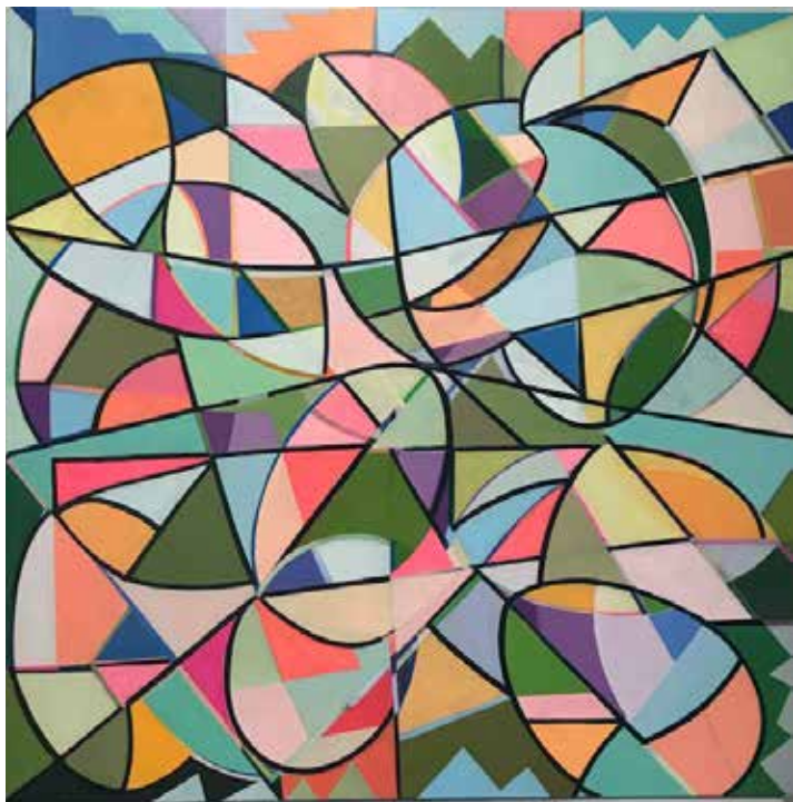
Daylight Savings , 2018, acrylic on wood panel, 48 x 48 inches $3,800