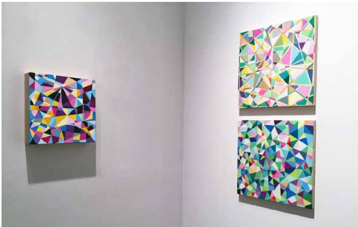
Viewfinder , 2018, installation view