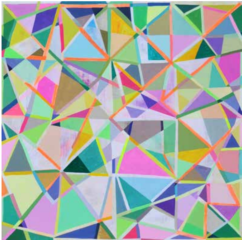
Where You Are, 2017 Gouache on panel 16 x 16 inches $1,400