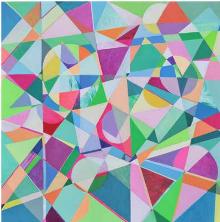
Morning Chemistries , 2017 Acrylic and gouache on wood panel 36 x 36 inches $3,000