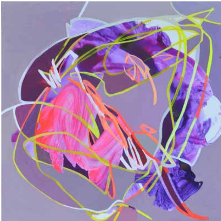
First Pony , 2015 Gouache on panel 16 x 16 inches $1,400