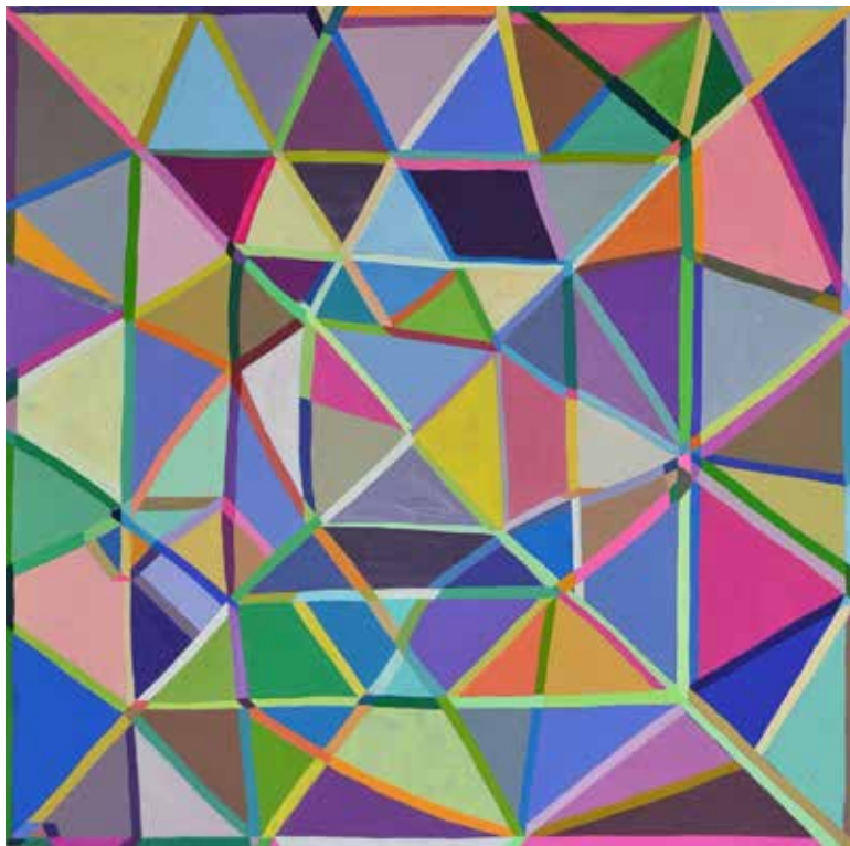
Hold You, 2016 Gouache on panel 16 x 16 inches $1,400