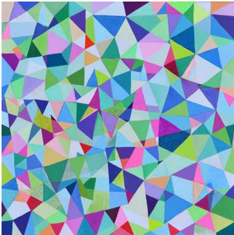
Swim Lessons , 2017 Gouache on panel 16 x 16 inches $1,400