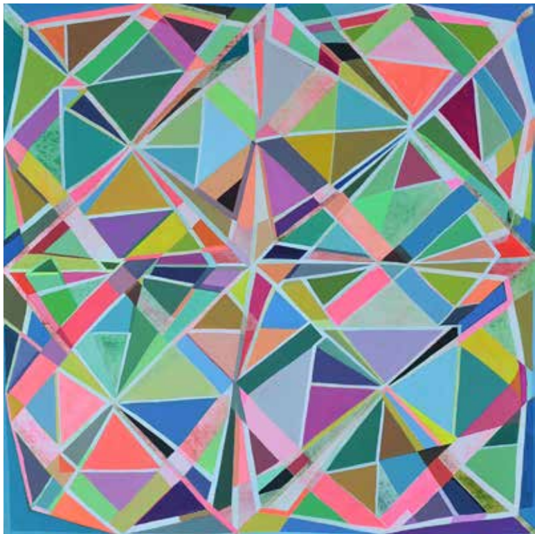
Sympathizer , 2016 Gouache on panel 16 x 16 inches $1,400