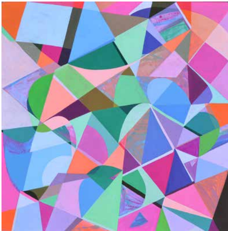
Bravest Woman in America, 2017 Gouache on panel 16 x 16 inches $1,400