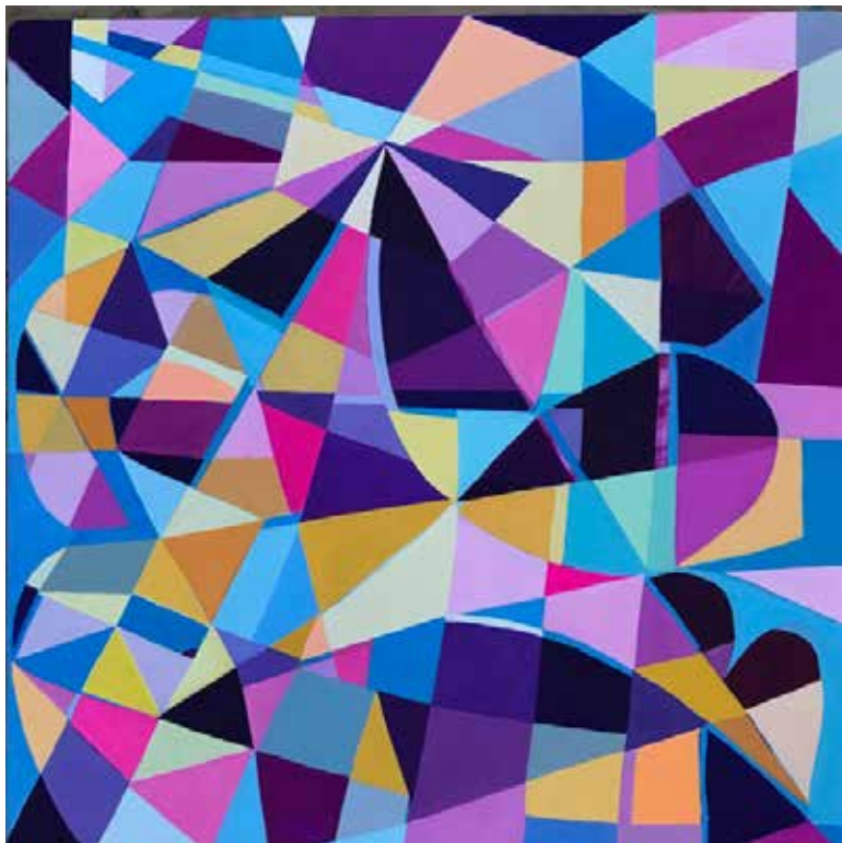
Bird in Flight, Saturday Night 2018 Gouache on panel 12 x 12 inches $1,100