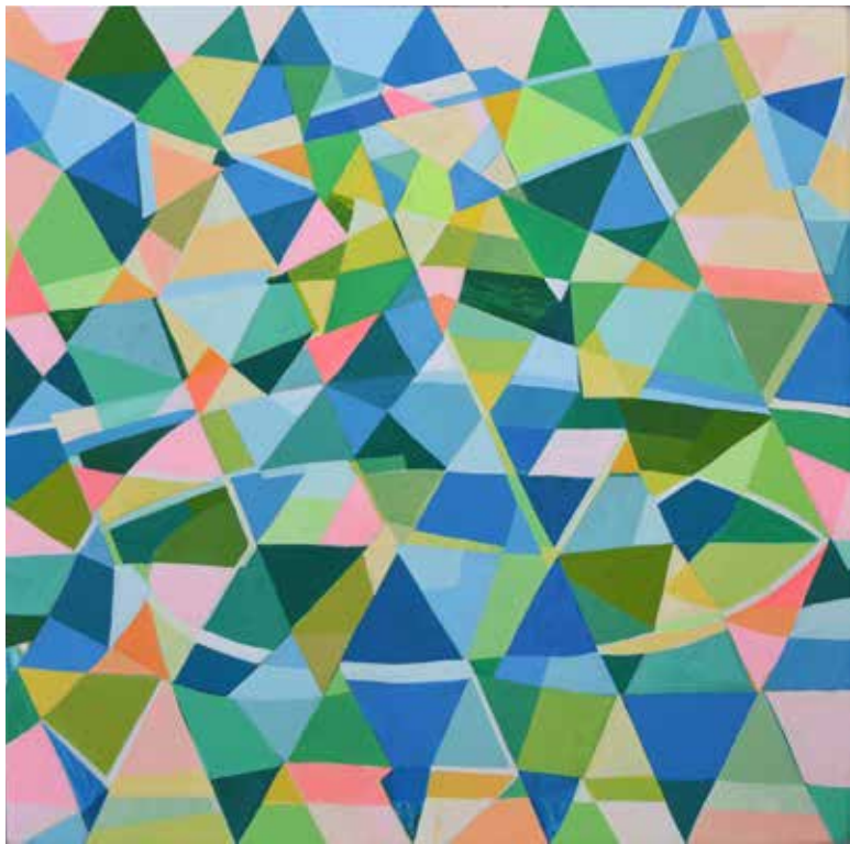
The Peak , 2018 Gouache on panel 16 x 16 inches $1,400