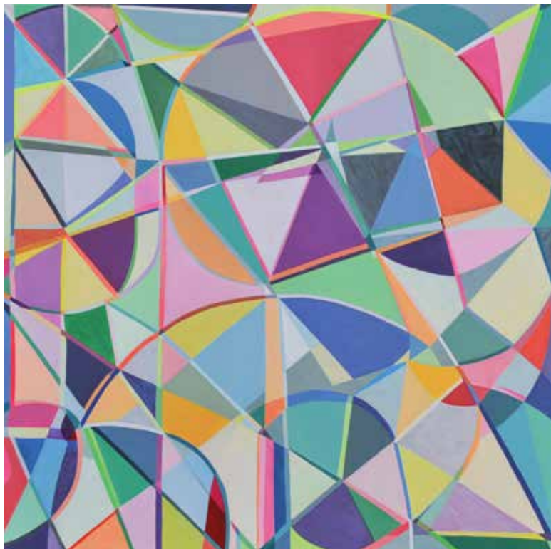
Beach Umbrella , 2017 Acrylic and gouache on wood panel 36 x 36 inches $3,200