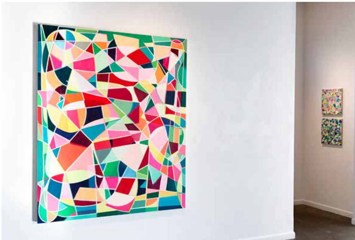
Viewfinder, 2018, installation view