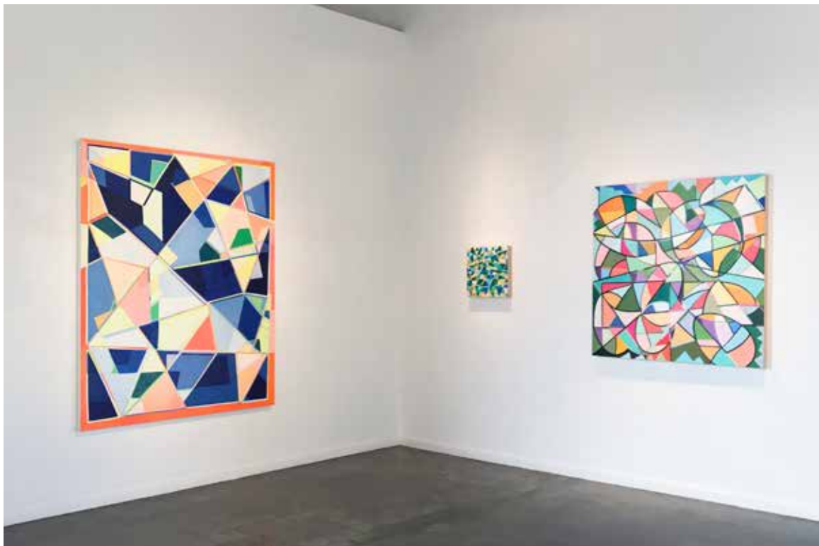
Viewfinder, 2018, installation view