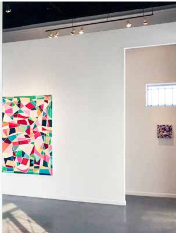
Viewfinder, 2018, installation view