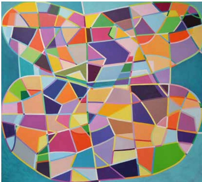
Butterfly , 2018, acrylic on canvas, 50 x 60 inches $4,800