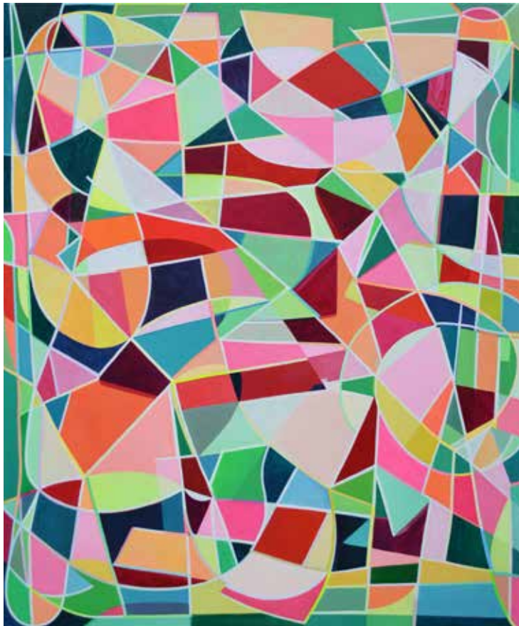
Dog-Eared , 2018 Acrylic on canvas 72 x 60 inches $6,200