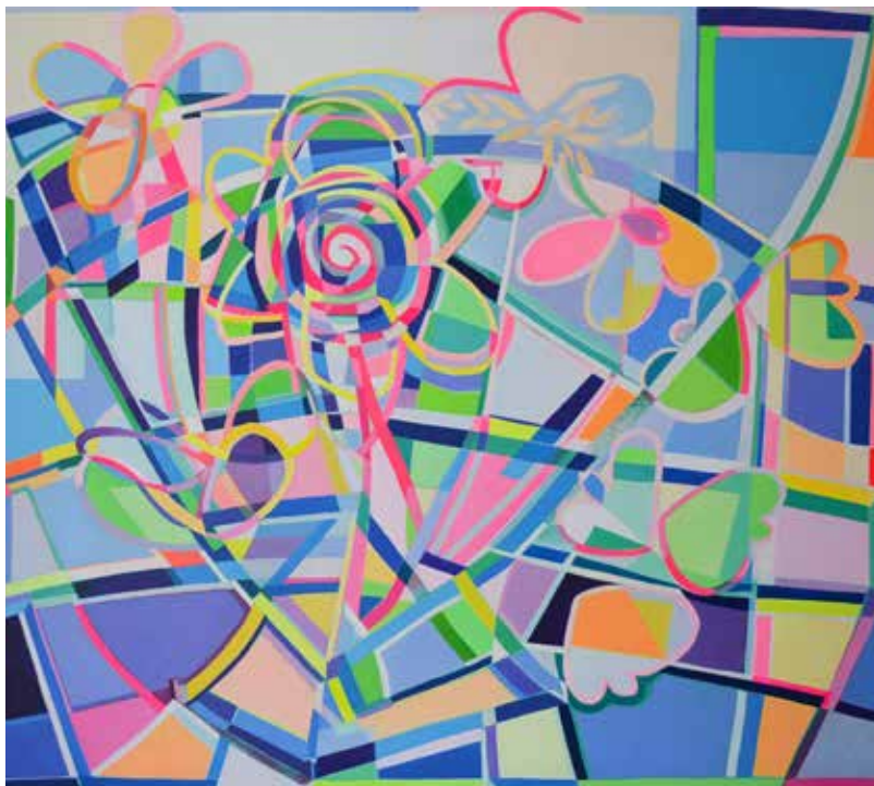
Drawing Lesson , 2018, acrylic on canvas, 50 x 60 inches $4,800