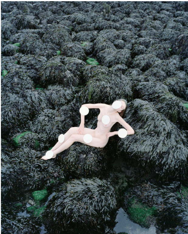
Untitled (Reverie Sleep) , 2013 Inkjet print on archival paper 30 x 24 in Ed. 1 of 5, $2,700