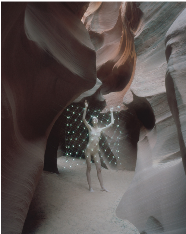
Untitled (Supernatural) , 2015 Inkjet print on archival paper 30 x 24 in Ed. 1 of 5, $2,700