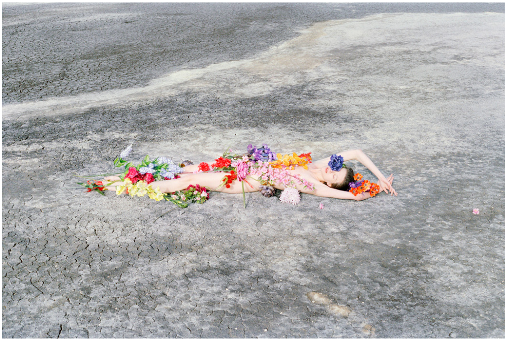
Untitled (Reverie Sleep) , 2013, inkjet print on archival paper, 43 x 54 in. Ed. 1 of 5, $4,600