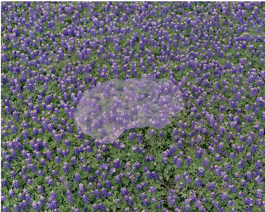
Untitled (Supernatural) , 2015, inkjet print on archival paper, 43 x 54 in. Ed. 1 of 5, $4,600