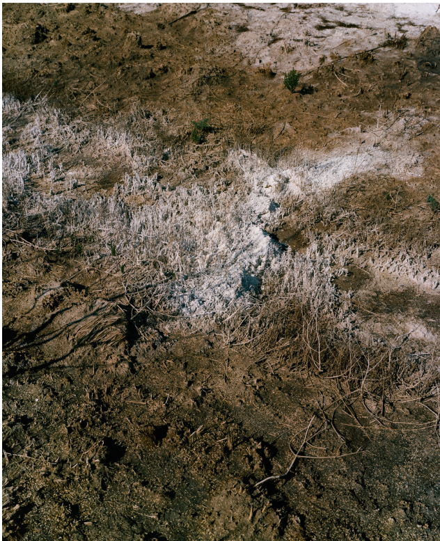
Untitled (Slightly Altered) , 2017 Archival inkjet print 18 x 14.4 in. Unique Ed. 1 of 1, $1,100 Framed