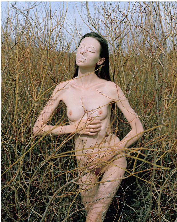
Untitled (Supernatural) , 2015 Inkjet print on archival paper 54 x 43 in. Ed. 1 of 5, $4,600