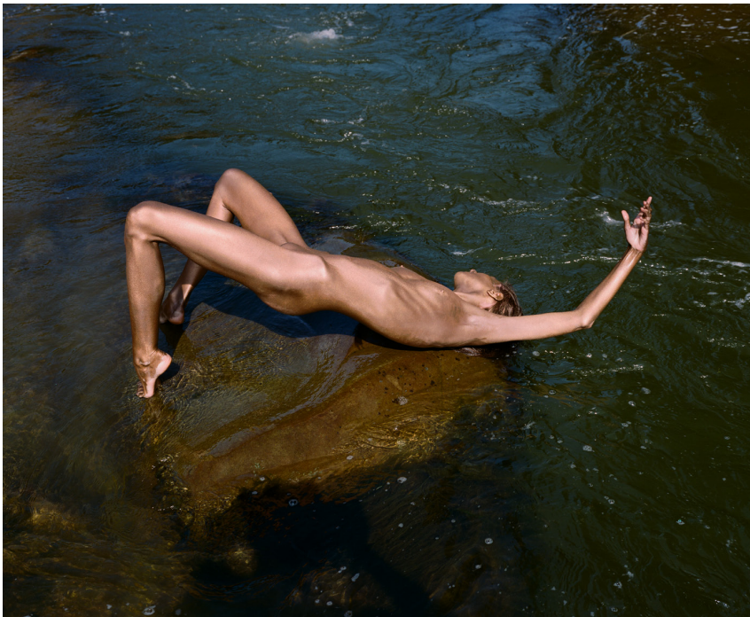
Untitled (Slightly Altered) , 2017, archival inkjet print, 14.4 x 18 in. Unique Ed. 1 of 1, $1,100 Framed