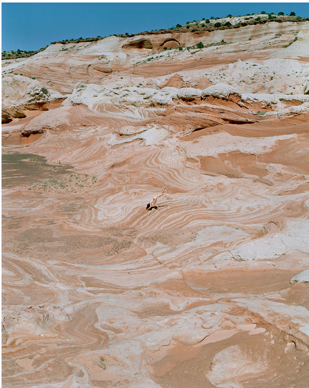
Untitled (Supernatural) , 2015 Inkjet print on archival paper 54 x 43 in. Ed. 1 of 5, $4,600