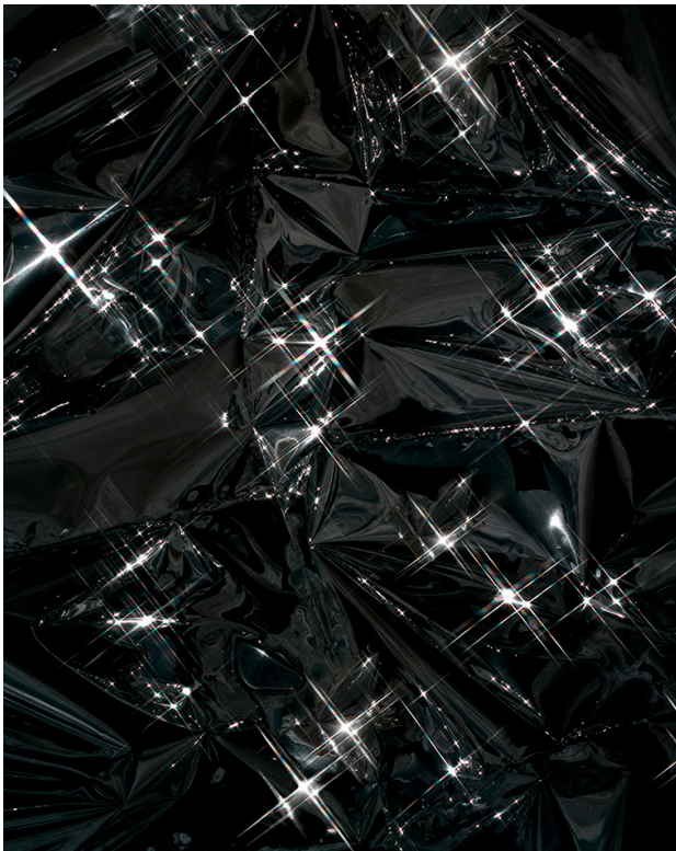
Untitled (Supernatural) , 2015 Inkjet print on archival paper 54 x 43 in. Ed. 1 of 5, $4,600