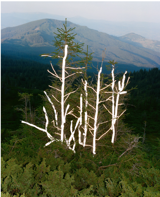
Untitled (Slightly Altered) , 2017 Archival inkjet print 44 x 54 in. Ed. 1 of 3, $4,000 Framed