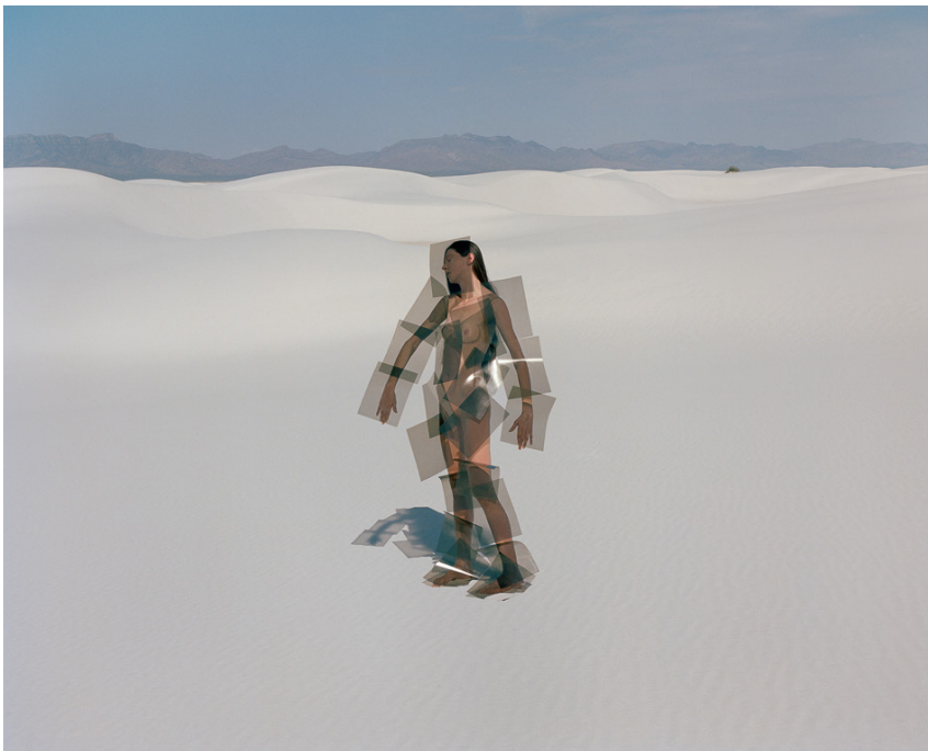
Untitled (Supernatural) , 2015, inkjet print on archival paper, 24 x 30 in. Ed. 1 of 5, $2,700