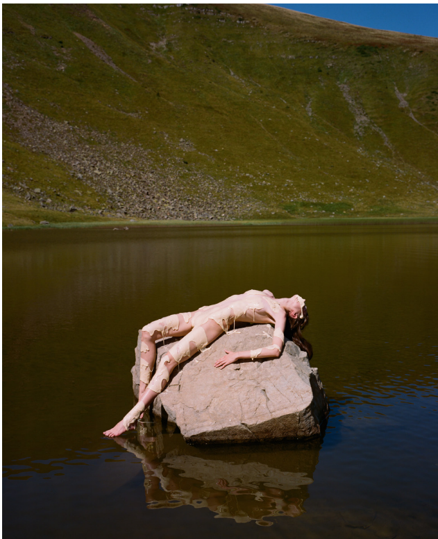
Untitled (Slightly Altered) , 2017 Archival inkjet print 18 x 14.4 in. Unique Ed. 1 of 1, $1,100 Framed