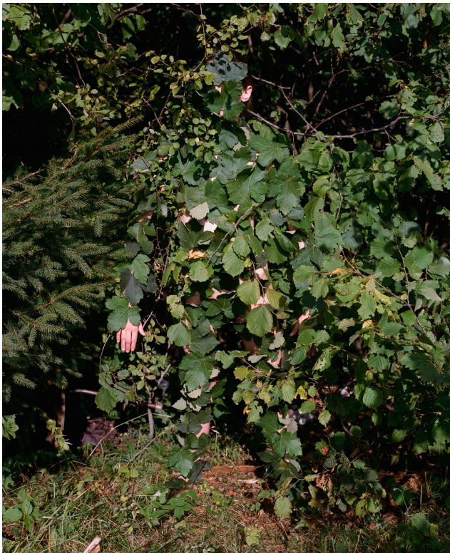
Untitled (Slightly Altered) , 2017 Archival inkjet print 18 x 14.4 in. Unique Ed. 1 of 1, $1,100 Framed