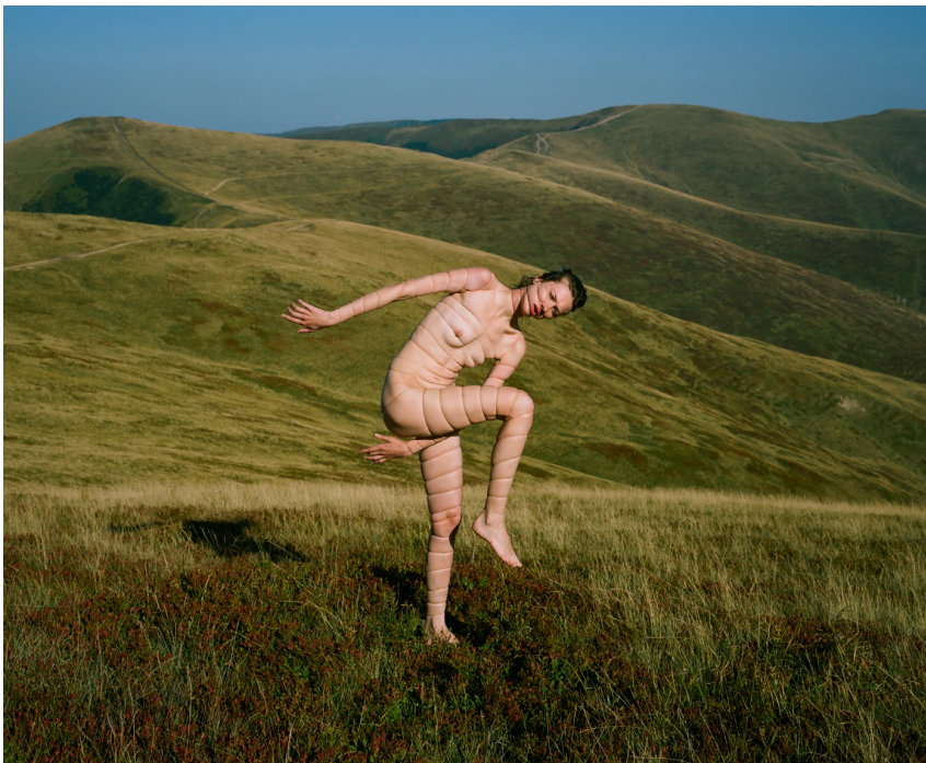
Untitled (Slightly Altered) , 2017, archival inkjet print, 14.4 x 18 in. Unique Ed. 1 of 1, $1,100 Framed