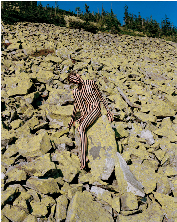
Untitled (Slightly Altered) , 2017 Archival inkjet print 29.5 x 23.6 in. Ed. 1 of 5, $1,400 Framed