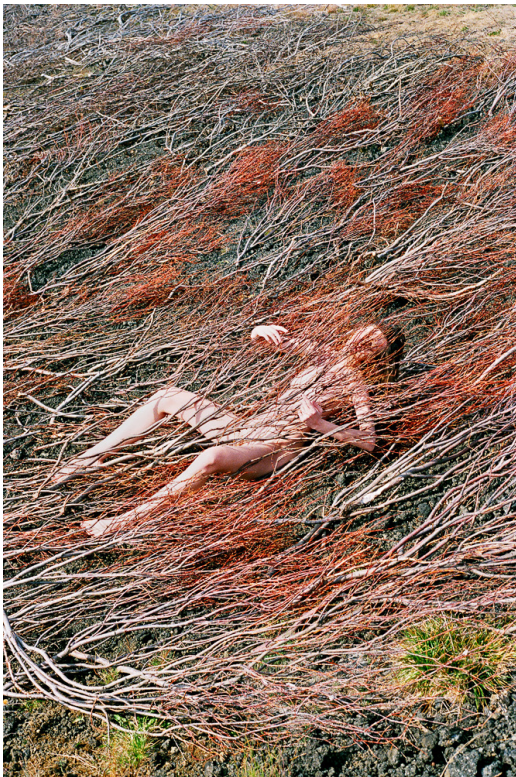
Untitled (Reverie Sleep) , 2013 Inkjet print on archival paper 36 x 24 in Ed. 2 of 7, $2,450