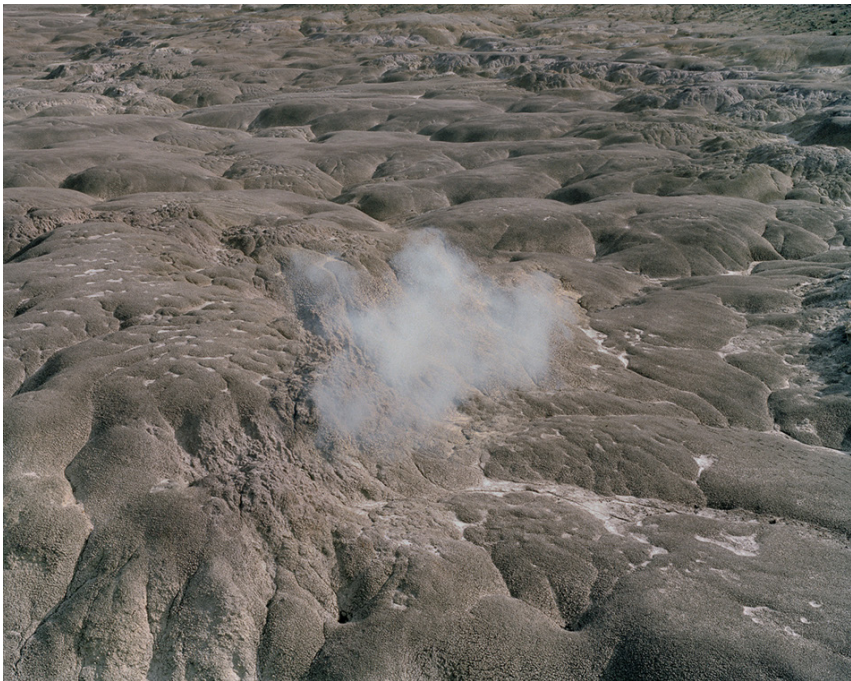
Untitled (Supernatural) , 2015, inkjet print on archival paper, 43 x 54 in. Ed. 1 of 5, $4,600