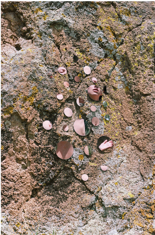
Untitled (Supernatural) , 2015 Inkjet print on archival paper 35 x 23 in Ed. 1 of 10, $2,500