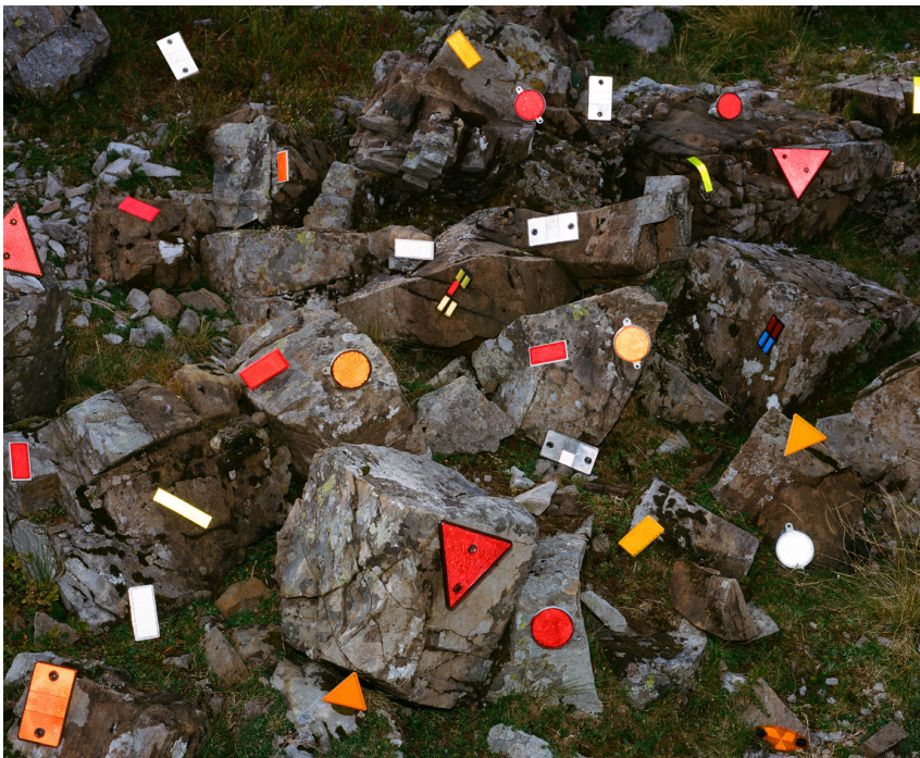
Untitled (Slightly Altered) , 2017, archival inkjet print, 34.5 x 43.3 in. Ed. 1 of 5, $2,300 Framed