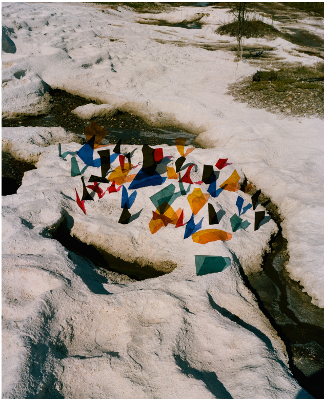
Untitled (Slightly Altered) , 2017 Archival inkjet print 44 x 54 in. Ed. 1 of 3, $4,000 Framed