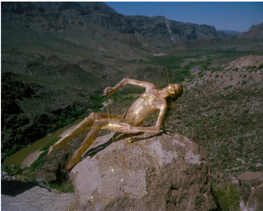
Untitled (Supernatural) , 2015, inkjet print on archival paper, 43 x 54 in. Ed. 1 of 5, $4,600