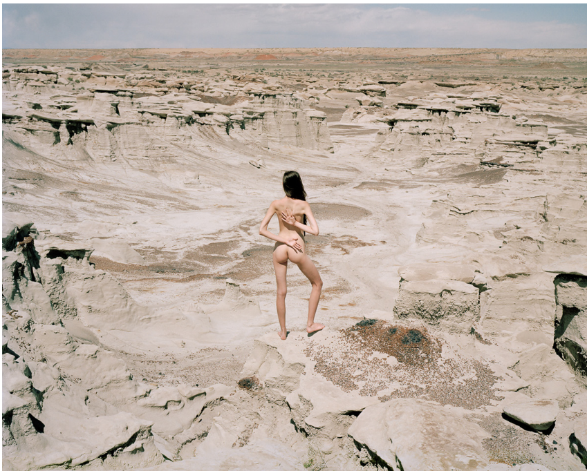
Untitled (Supernatural) , 2015, inkjet print on archival paper, 43 x 54 in. Ed. 1 of 5, $4,600