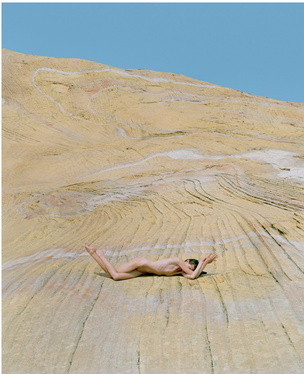
Untitled (Supernatural) , 2015 Inkjet print on archival paper 43 x 35 in Ed. 1 of 5, $3,500