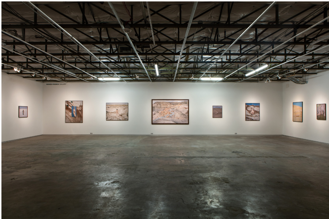
Supernatural Project , 2015, installation view at the Dallas Contemporary