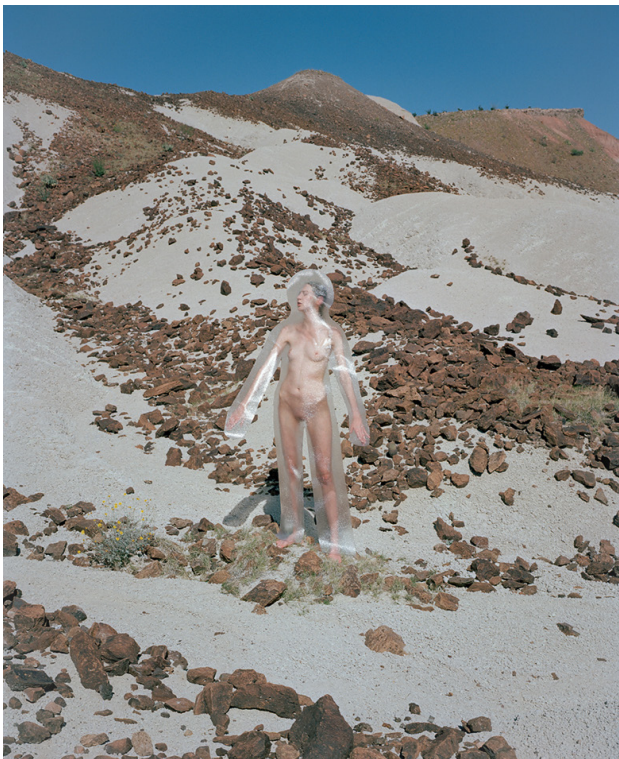
Untitled (Supernatural) , 2015 Inkjet print on archival paper 43 x 35 in Ed. 1 of 5, $3,500