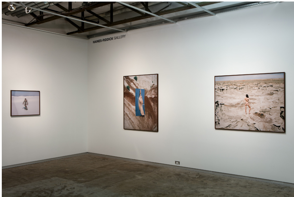
Supernatural Project , 2015, installation view at the Dallas Contemporary