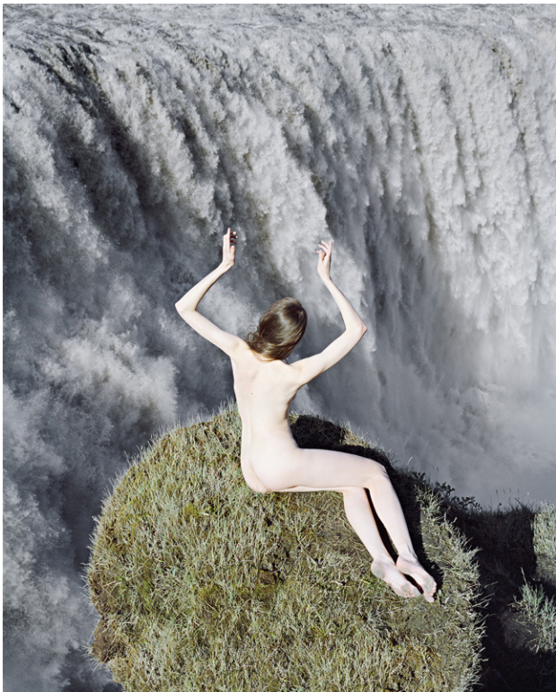
Untitled (Reverie Sleep) , 2013 Inkjet print on archival paper 30 x 24 in Ed. 1 of 5, $2,700