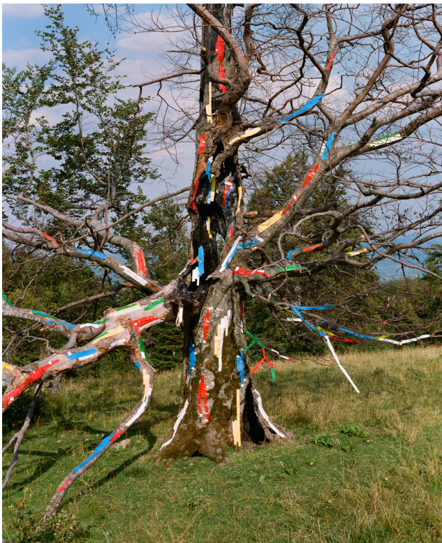
Untitled (Slightly Altered) , 2017 Archival inkjet print 43.3 x 34.5 in. Ed. 1 of 5, $2,300 Framed