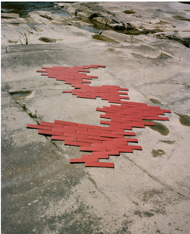
Untitled (Slightly Altered) , 2017 Archival inkjet print 29.5 x 23.6 in. Ed. 1 of 5, $1,400 Framed