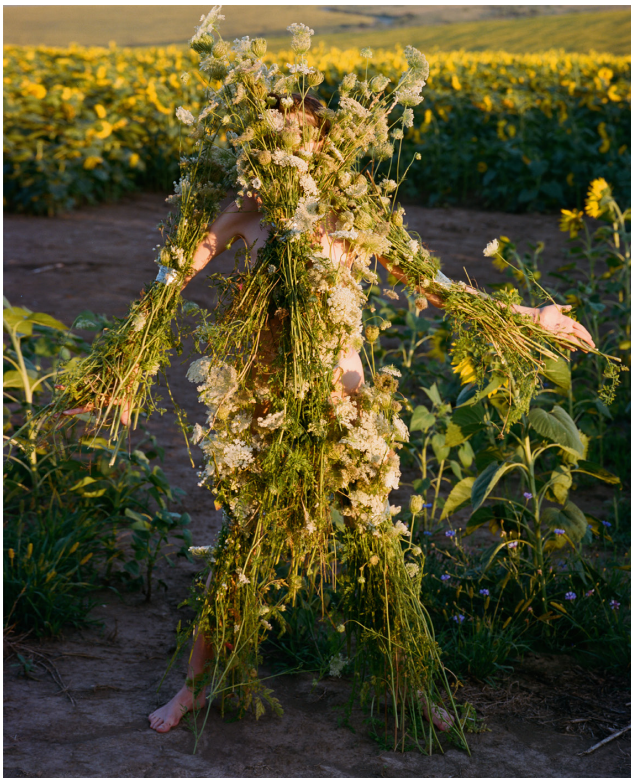
Untitled (Slightly Altered) , 2017 Archival inkjet print Available by request