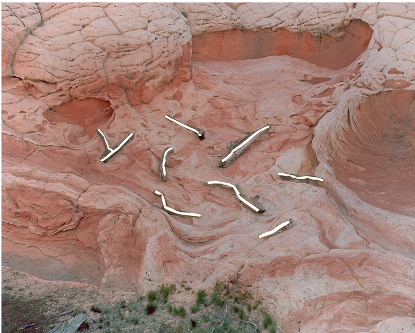
Untitled (Supernatural) , 2015, inkjet print on archival paper, 43 x 54 in. Ed. 1 of 5, $4,600