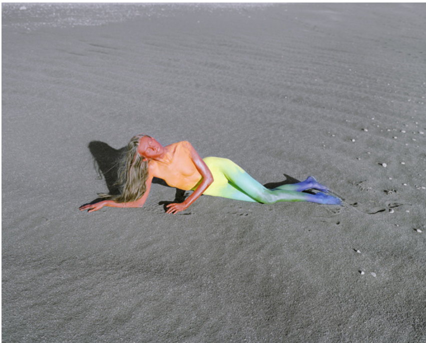
Untitled (Reverie Sleep) , 2013, inkjet print on archival paper, 24 x 30 in. Ed. 1 of 5, $2,700