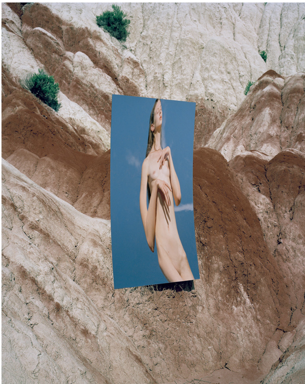
Untitled (Supernatural) , 2015 Inkjet print on archival paper 54 x 43 in. Ed. 1 of 5, $4,600