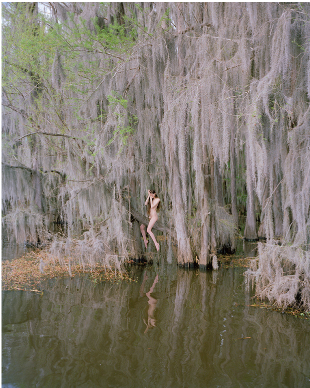
Untitled (Supernatural) , 2015 Inkjet print on archival paper 30 x 24 in Ed. 1 of 5, $2,700