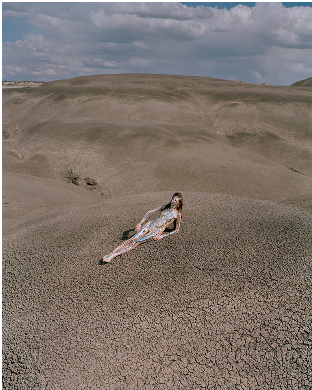
Untitled (Supernatural) , 2015 Inkjet print on archival paper 30 x 24 in Ed. 1 of 5, $2,700