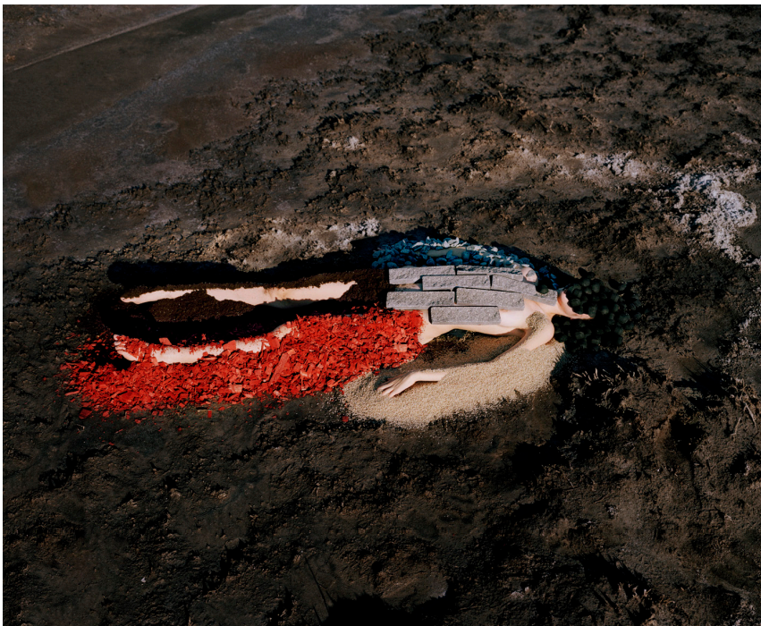
Untitled (Slightly Altered) , 2017, archival inkjet print, 23.6 x 29.5 in. Ed. 1 of 5, $1,400 Framed