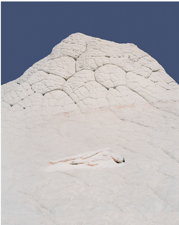
Untitled (Supernatural) , 2015 Inkjet print on archival paper 54 x 43 in. Ed. 1 of 5, $4,600