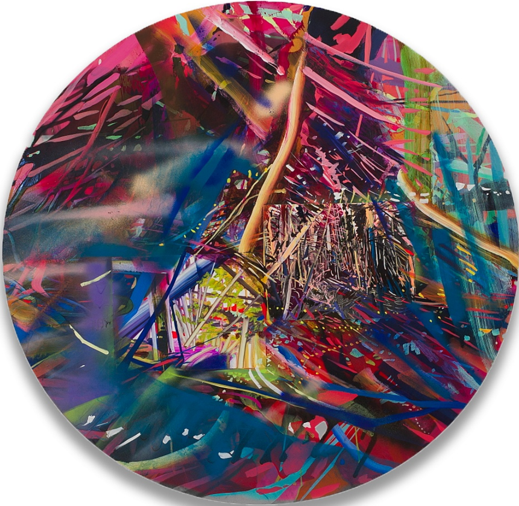
Arden Browning East Coast Trail Trees 2, 2022 acrylic, acrylic gouache, spray paint, yupo collage on shaped panel 48h x 48w in