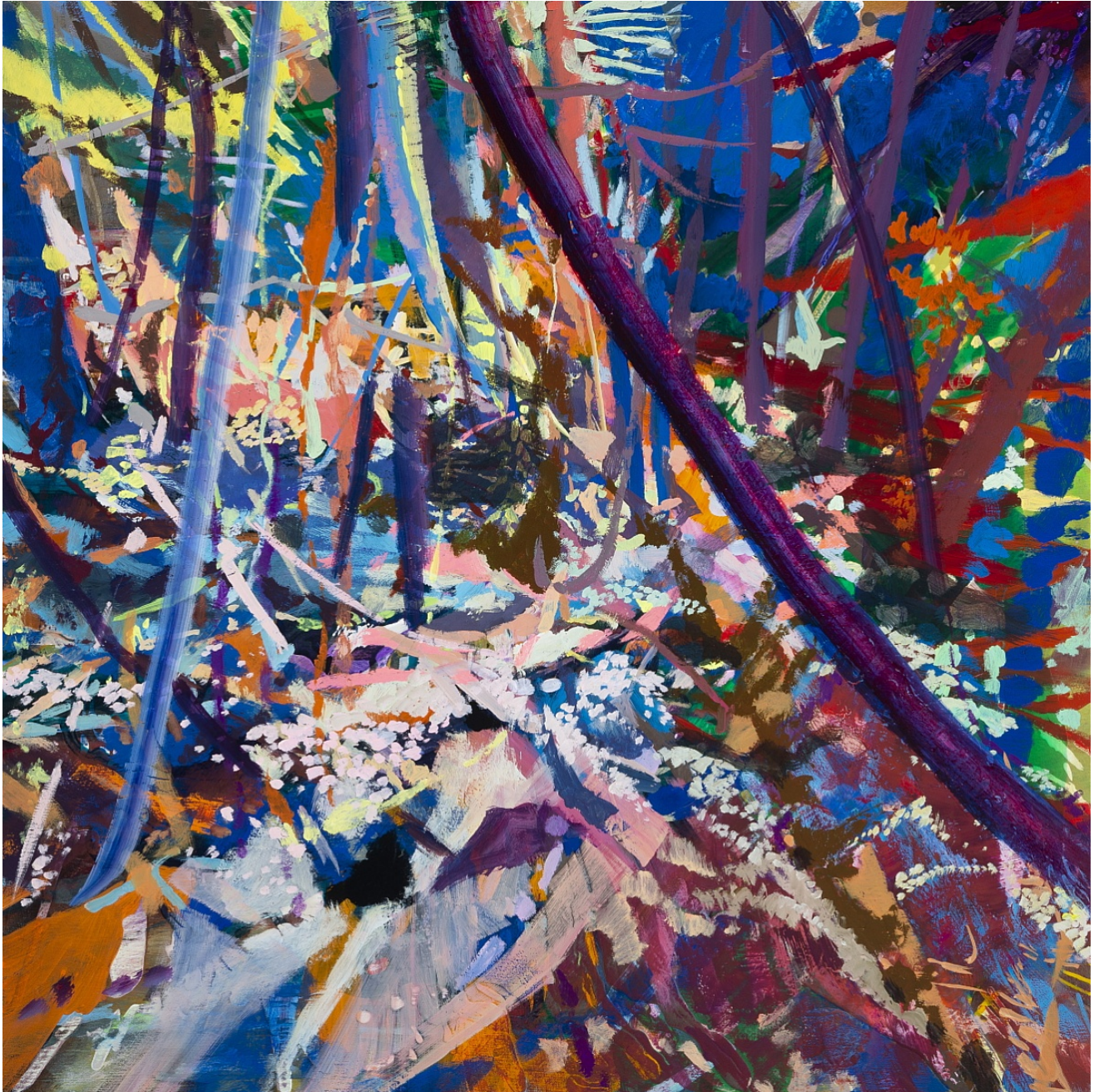
Arden Browning walking with my eyes, 2022 acrylic gouache on wood panel 24h x 24w in