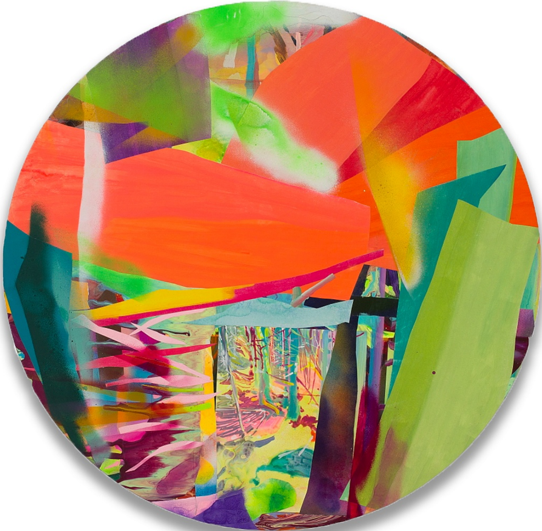
Arden Browning East Coast Trail 3, 2023 acrylic, spray paint, mural cloth and yupo collage on shaped panel 40h x 40w in sold