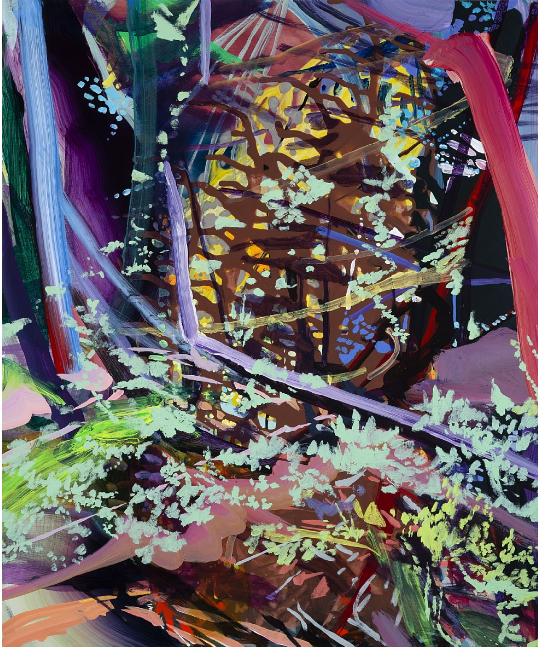
Arden Browning remembering moss during last stretch of Primrose backpacking hike, 2022 acrylic and acrylic gouache on wood panel 20h x 24w in