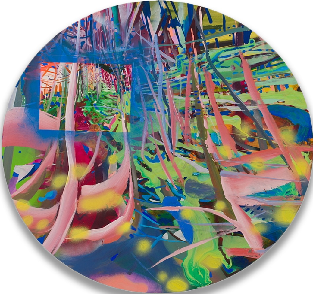
Arden Browning East Coast Trail Trees 1, 2023 acrylic, acrylic gouache, spray paint, yupo collage on shaped panel 48h x 48w in