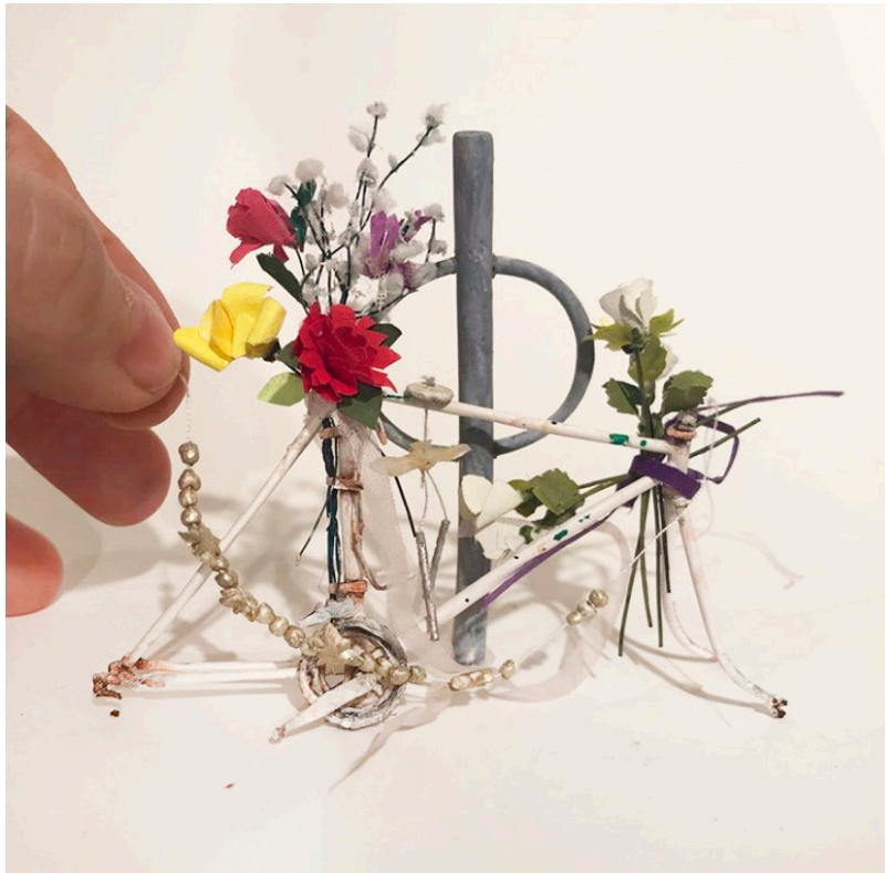
Ghost Bike (Hinkley St) , 2019 Gouache, polymer clay, wire, thread, fabric 3.20h x 3.60w x 2.10d in