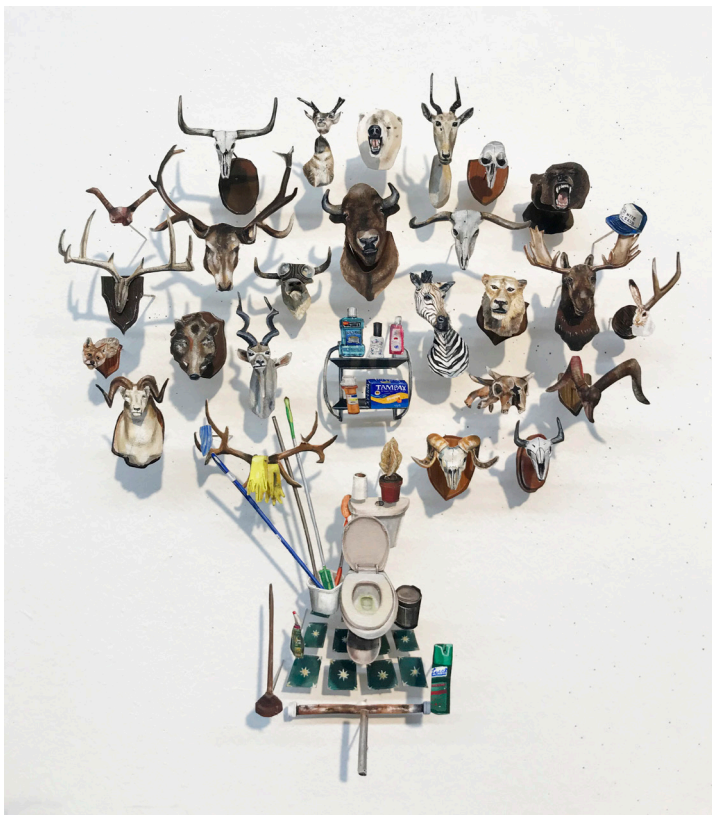
Bathroom , 2019 Gouache, paper, pins 8.5 x 6.5 x 2 in.