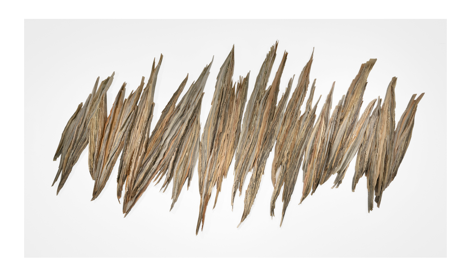
Sheaf 1 Book pages, wax 74" x 138" x 4"